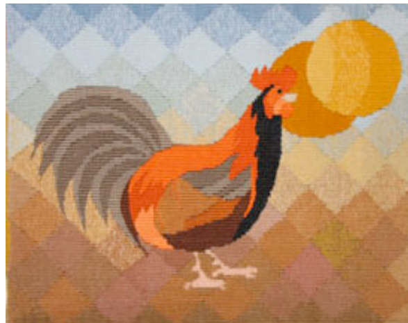
The Cock Crows Night and Day Elaine Duncan

I teach weaving classes and find it very easy to refer my students to my website and blog for the latest information. I have included directions to my home/studio and contact information. My website is also an opportunity to promote lectures, workshops, fibre events and gatherings hosted by other organizations. My goal is to build the website to be a resource for the fibre/weaving/tapestry world.